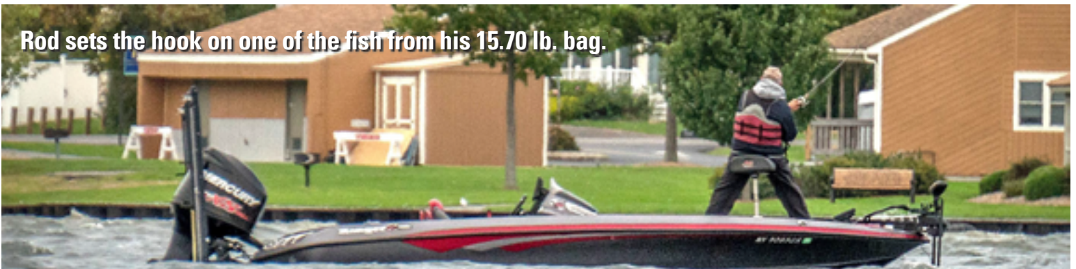
Rod sets the hook on one of the fish from his 15.70 lb. bag.