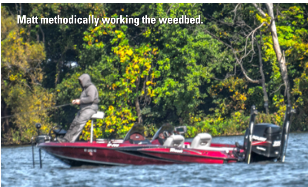
Matt methodically working the weedbed.