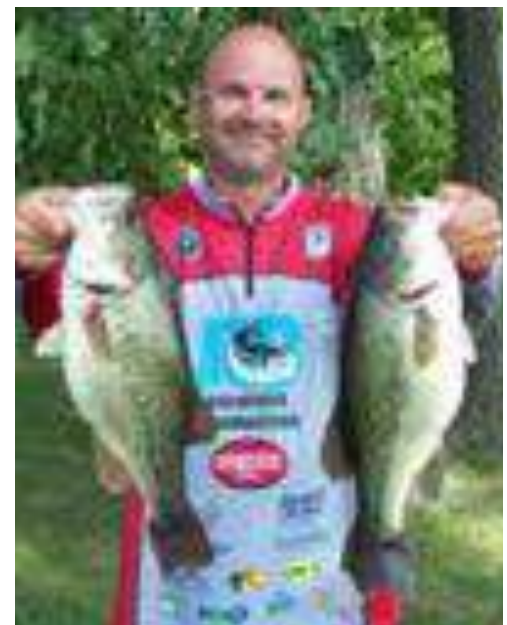
TIGE NONI 3rd Place - 15.78 lbs.